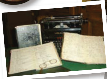
Original recipes from the 19th century

The Old Vienna Distillery is the only authentic historical Austrian Absinthe distillery since the 19th century. It has been run by the Fischer family for five generations.